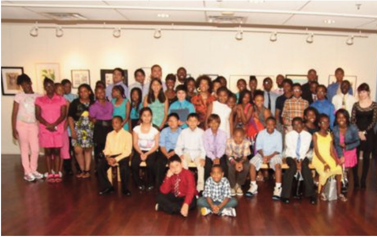
2013 graduating class.