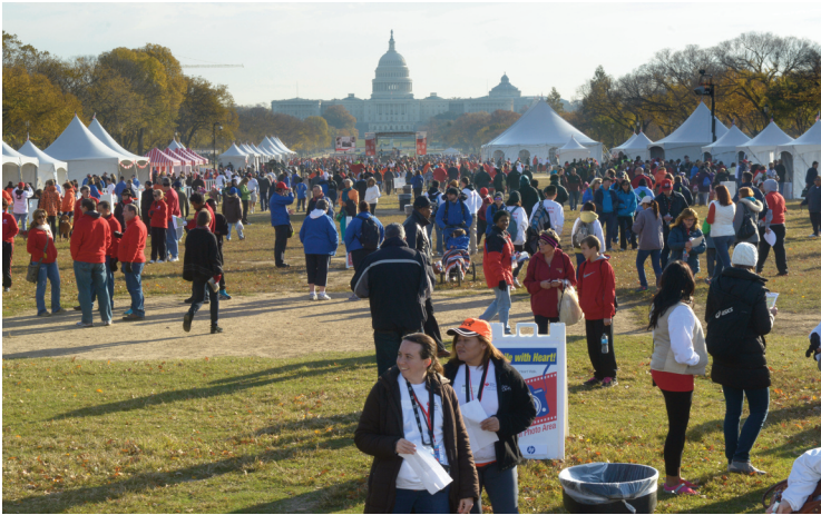
Heart Walk volunteers and participants on the National Mall.