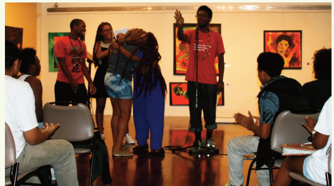
Winning Slam Poets announced to move on to next round of competition.