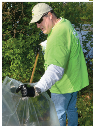
Pepco "Green Team" employee volunteers in action during the Anacostia River Cleanup event.

This year's effort turned up a variety of plastics, glass, metal, and paper products that are now no longer cluttering the waterway. Pepco served as a silver sponsor of this year's event.