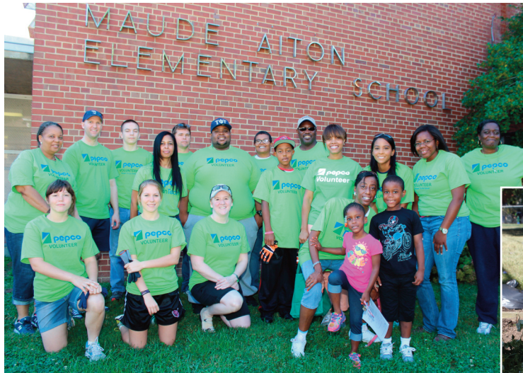
Pepco "Green Team" members pose in front of Maude E. Aiton Elementary School in the District of Columbia after spending the day helping to clean up and beautify the school grounds.